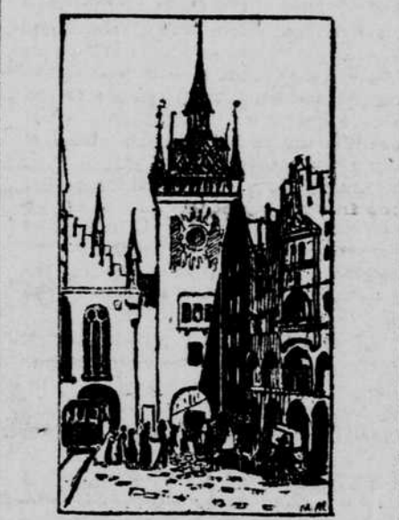
Old Rathaus in Munich.

Perhaps the wide streets and spacious buildings of Munich have something to do with the freedom of thought of its people. There is no cramped-up feeling here, that is so characteristic of most cities. Ludwigsstrasse is one of the most imposing streets in the world. It runs from the village of Schwabing, a broad straight street, and lined with beautiful massive buildings, down into the center of town, and is terminated by a building that is a copy of the Loggia at France. In a way it is more beautiful than the original, for it is raised from the ground and looks more imposing. Every Sunday morning the city band plays here and the people gather along Ludwigsstrasse to listen to the music. Such happiness these people get from simple pleasures every afternoon. The same band plays in the Hofgarten and the park is packed with people who stop their work to feed their souls. Some parade back and