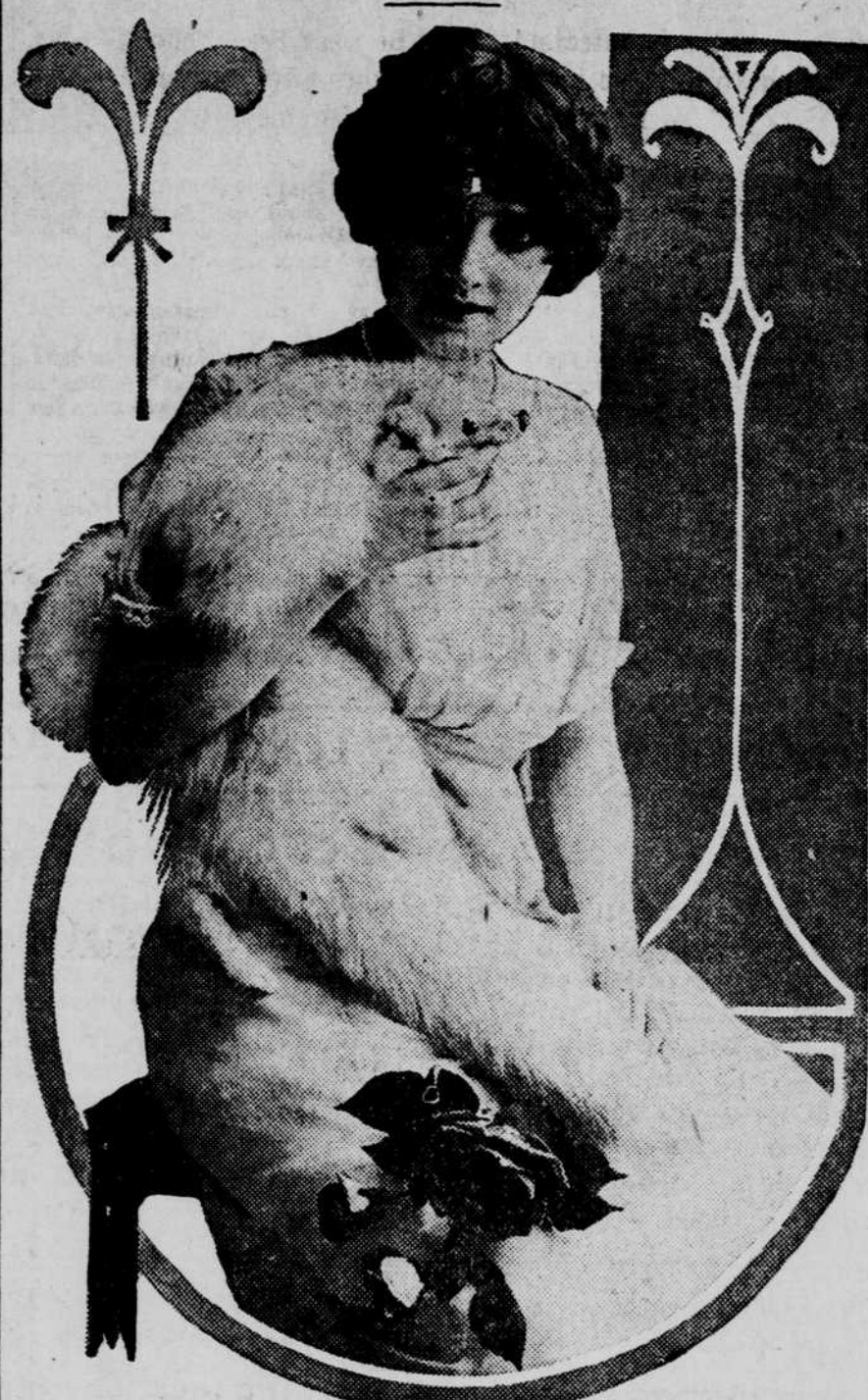
The latest fable of fashion is the fur fox scarf. The inanimate decoration is used by the young lady in the guise of a pet. It is also used for a neck covering on evening gowns. It is one of the winter's novelties.