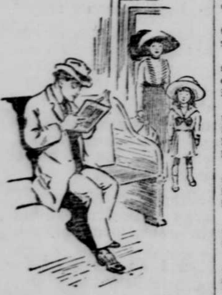
Floyd Was Seated on One of the Waiting Room Benches Reading a Magazine.

CHAPTER I-At the beginning of great automobile race the mechanic of the Mercury, Stanton's machine, drops dead. Strange youth, Jesse Floyd, volunteers, and is accepted.