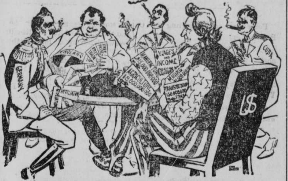
UNCLE SAM STANDS PAT IN THE WORLD'S GAME.

CANADIAN IDEA OF A RECI-PROCITY ARRANGEMENT.