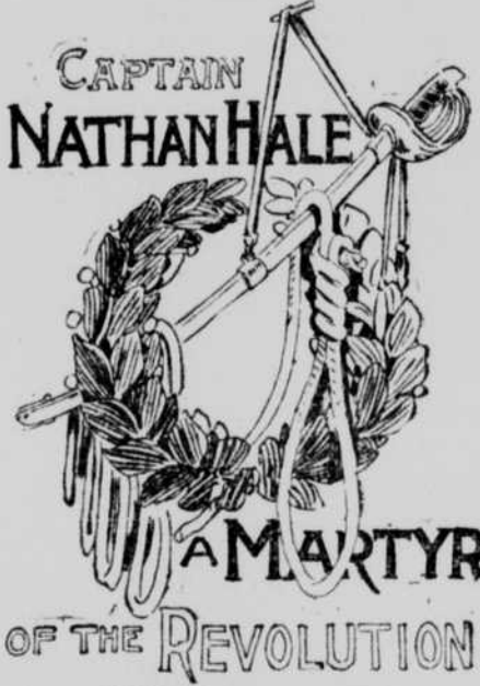
CAPTAIN NATHAN HALE A MARTYR OF THE REVOLUTION

General Washington wanted a man. It was in September, 1776, at the City of New York, a few days after the battle of Long Island. The swift and deep East River flowed between the two hostile armies, and General Washington had as yet no system established for getting information of the enemy's movements and intentions. He never needed such information so much as at that crisis.