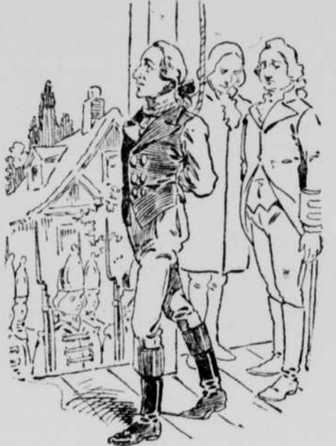
"I ONLY REGRET THAT I HAVE BUT ONE LIFE TO LOSE FOR MY COUNTRY."

Short was his trial, for he avowed at once his true character. The British general signed an order to his provost-marshal directing him to receive into his custody the prisoner convicted as