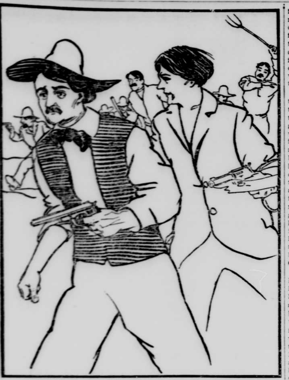
The Two Led the Way, Followed by a Dozen Men.