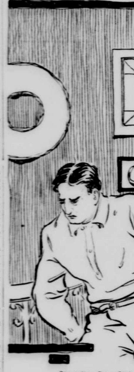
Struggling Down-Stairs with a Heavy Trunk.