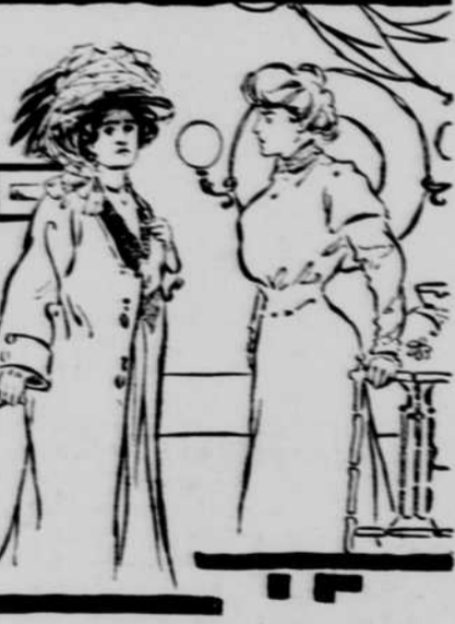
"I Believe You Know This Whole Horrible Thing, This Mystery."

"Where is Halsey?" she demanded. Above her plain black gown her eyes looked big and somber, and the rapid drive had brought no color to her face.