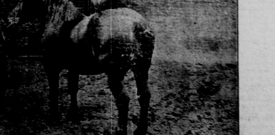
ACTUAL PHOTOGRAPH OF "BRAIN" WHEN TWO YEARS OLD

TERMS OF SERVICE.--$15.00 to insure mare with foal; $20.00 to insure colt to stand and suck. If mare is traded, sold or removed from county, foal bill of same will become due and I will expect immediate settlement. Care will be taken to prevent accident, but will not be responsible should any occur.