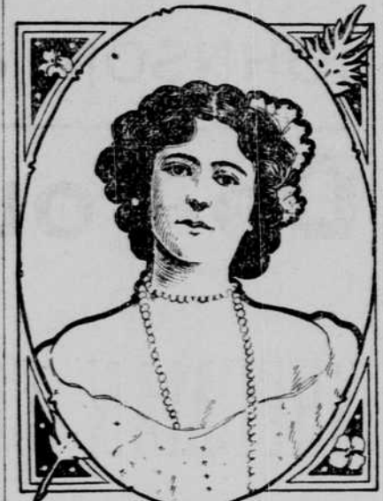
A FIRM, WHITE NECK.

The skin of the throat and the general condition of the neck registers accurately just how much or how little care a woman is giving herself.