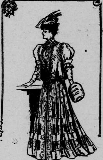
Cream breadcloth braided in sou-tache braid of darker color.

Short skirts for evening wear are still popular among very young women. For dancing there is no question about their being practical and decidedly comfortable. But a woman over 25 should not think of it.