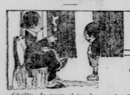
Cholly-Is your sister in, my boy? Willie-Just give me your card, and I'll go and see if you're de guy she told me to tell dat she was out.