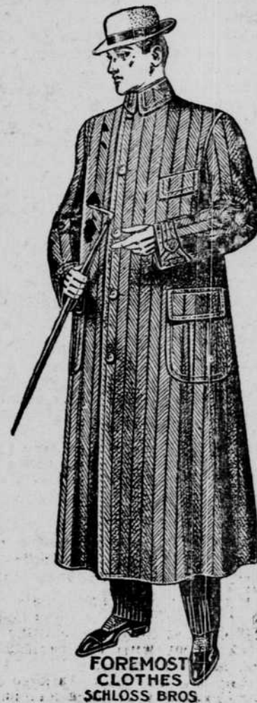
FOREMOST CLOTHES SCHLOSS BROS. DETROIT, MICH.

Come in and see us before buying. We will please you.