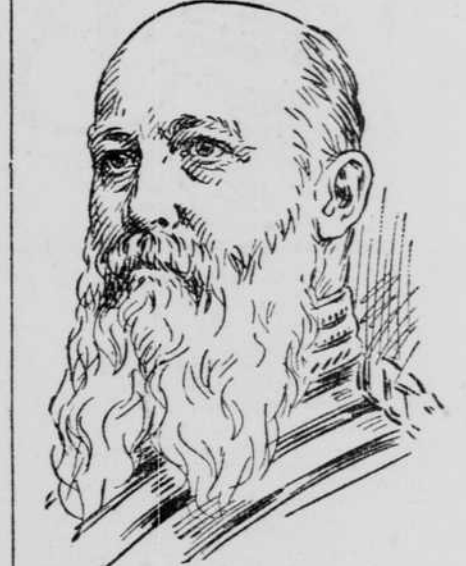
Admiral von Tirpitz.

The evolution of the Dreadnought type, which rendered virtually obsolete most of the ships not only of Germany but of England as well, evened up matters among the rival maritime powers. It gave them unexpectedly an opportunity to enter the grand