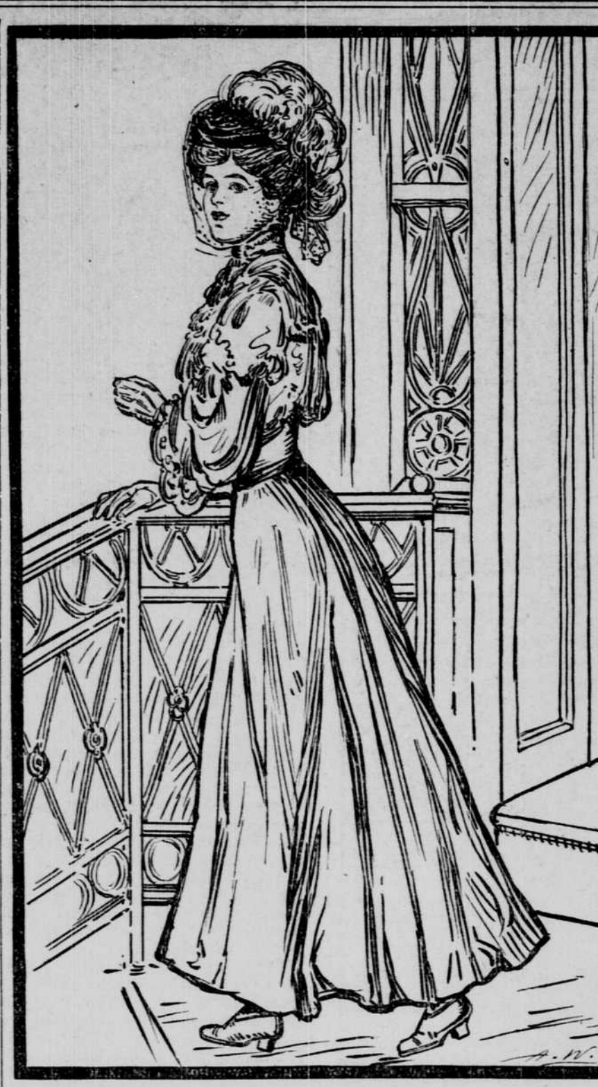
The Sight of a Young and Attractive Woman Coming Out of a Home for Confirmed Bachelors.