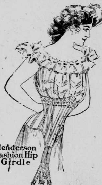
Henderson Fashion Hip Girdle