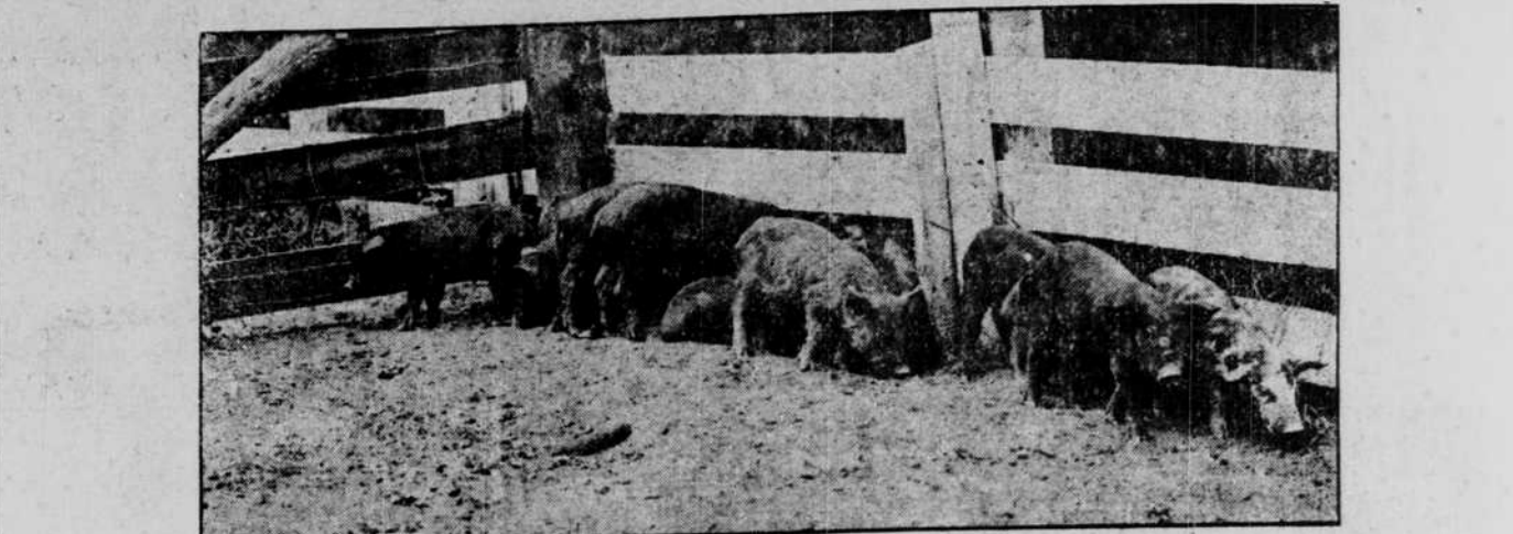
The above picture represents a lot of pigs stricken with swine plague and was cured by the Council Bluffs Remedy Company which proves to a certainty the value of our goods

Shower of Sulphur. Charolles, a small town 30 miles from Macon, in France, has recently been visited by a shower of sulphur.