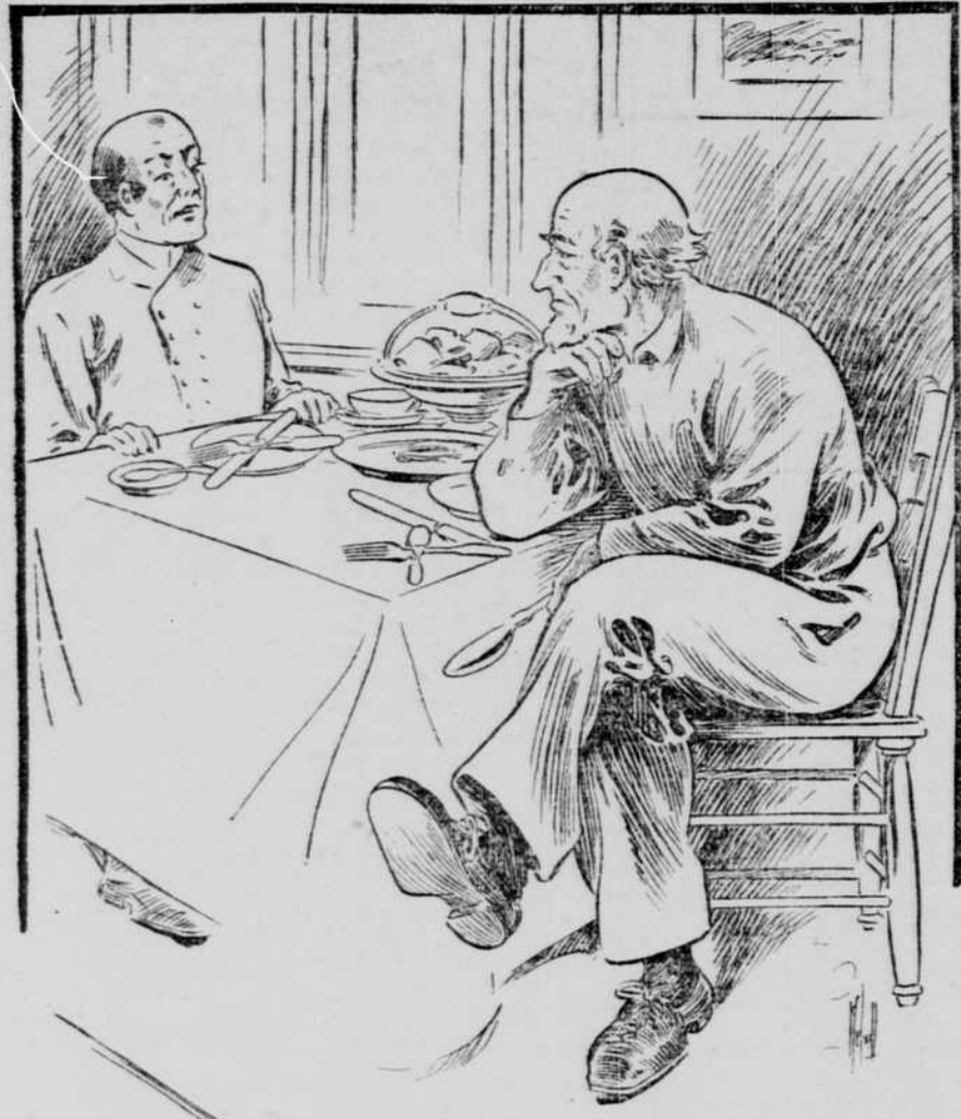
"What's the Use of 'Er Lowering 'Erf to Marry a Man Whose Father Got 'Is Money in Trade?"