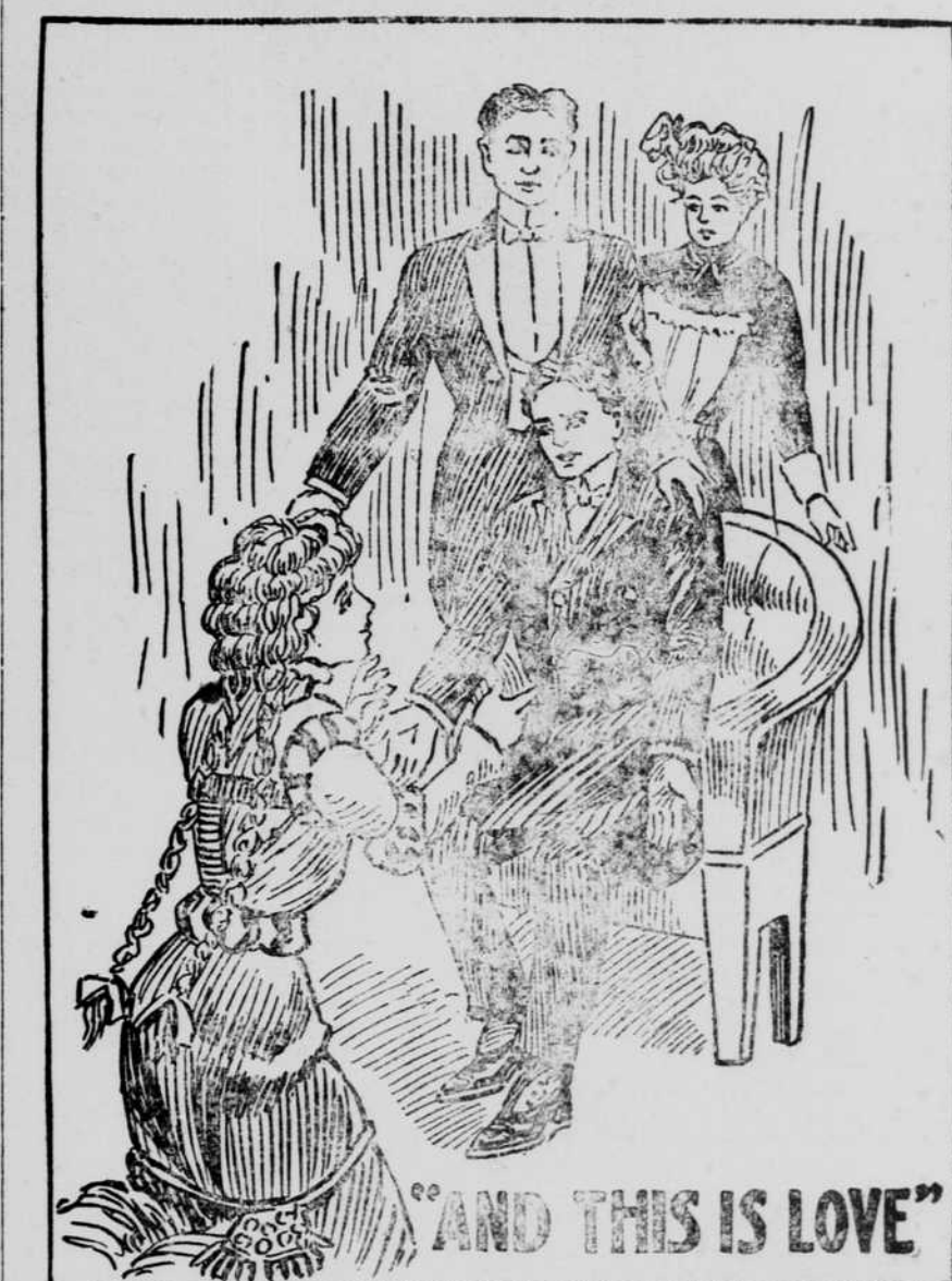
"AND THIS IS LOVE"