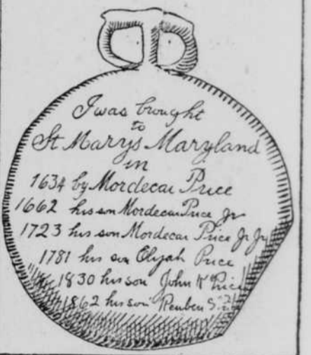
Dial and Back of Ancient Watch.