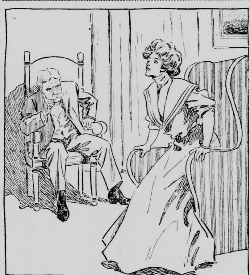
"Two Treatments Evoked the Realistic Touch of Bernhardt!"

Other readings show even less favorable results. The fall is more noticeable during the spring than during other periods of the year. Similar prenomena are recorded in Great Britain, Belgium, Spain, Italy, Austria and Germany. In the days of Philip Augusta, in the thirteenth century, the wines of Etampes and Beauvais were product of the Suresnes grape. At the "Kleptomania, habitual falsehood, present day there is not a vineyard