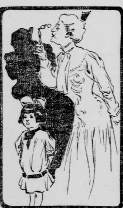
"Had They Seen Her Abigail?"

"See here! If you've finished, get a move on and give somebody else a show! Say, Mame! there's one o' them up-town girls that think so much of themselves. Why, they ain't a marker to you! I tell you, you're worth-Fifteen cents, please, and the cup