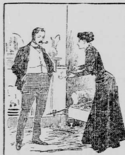
She-I will have the last word! He-You have the last line, my dear, that's a better game.