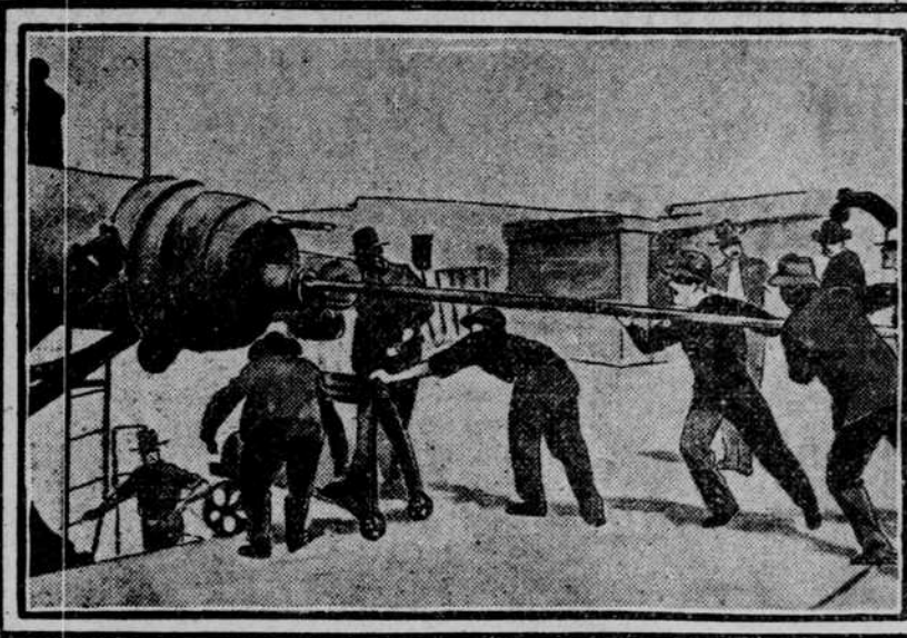
RAMMING HOME A PROJECTILE IN A TEN-INCH DISAPPEARING GUN.

Now that the American battleship fleet is well on its way to the Pacific, leaving the Atlantic coast practically without any warships for its protection, the question naturally arises in the minds of a great many people as to what would happen if foreign complications should suddenly arise with some of the European powers? Would the big cities along the coast—Boston, New York, Philadelphia, Baltimore, and other cities—be at the mercy of a hostile fleet. Only a few years back, during the Spanish-American war, when the American fleets were ordered to Cuban waters in the course of the Spanish-American war, some persons were troubled because the shore resorts of the country were suffered to be left to the mercy of what proved to be the well-nigh harmless Spanish fleet. Apparently they assumed that it was essential to the success of the enemy that it should shell summer hotels with a great expenditure of powder. And now once again an American fleet, comprising a large proportion of the vessels of the Atlantic squadrons, has left the eastern coast of the country for a period of several months. No war is now in progress, but the "radiplane," swifter than thought in its flight, possessed of the power to lift ships from their watery ways and transport them thousands of miles through the air, has yet to be invented. "What would happen to New York or Boston or Baltimore or Washington should war break out unexpectedly? Are these ports amply protected?" asks the man in the street.