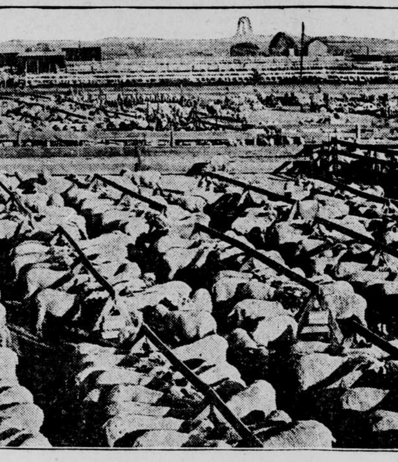
Lambs Being Fed on Kafir Corn, Pec os Valley.

The consumption of mutton per capita in the United States is increasing every year, though the amount used is much less in proportion to other meat than in Europe. There are good reasons for expecting a continuation of good prices for mutton and lamb, and the demand for wool also may be expected to increase more rapidly than the production. These facts are brought out in a recent letter from a scientist of the department of agriculture to a southern farmer who inquired regarding the possibilities of the sheep business.