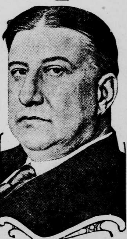
William Barnes, Jr., Republican political leader of New York state, as he appeared at Syracuse when his libel suit against Colonel Roosevelt was called for trial.

Thoughtless Explanation. "You say this will be your farewell appearance?" asked the interviewer. "Yes," answered the eminent actress. "I shall retire from the stage, never to return to it." "What is your reason for such a decision?" "My manager thinks it better for business to make every other tour a farewell engagement."