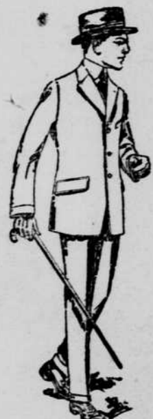
Herman Witt & Co., Buffalo, N. Y.