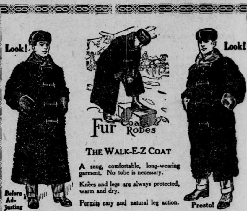
THE WALK-E-Z COAT

Exception. A Young Thing is fairly certain to think she knows more than her mother about everything but the kitchen work.—Atchison Globe.