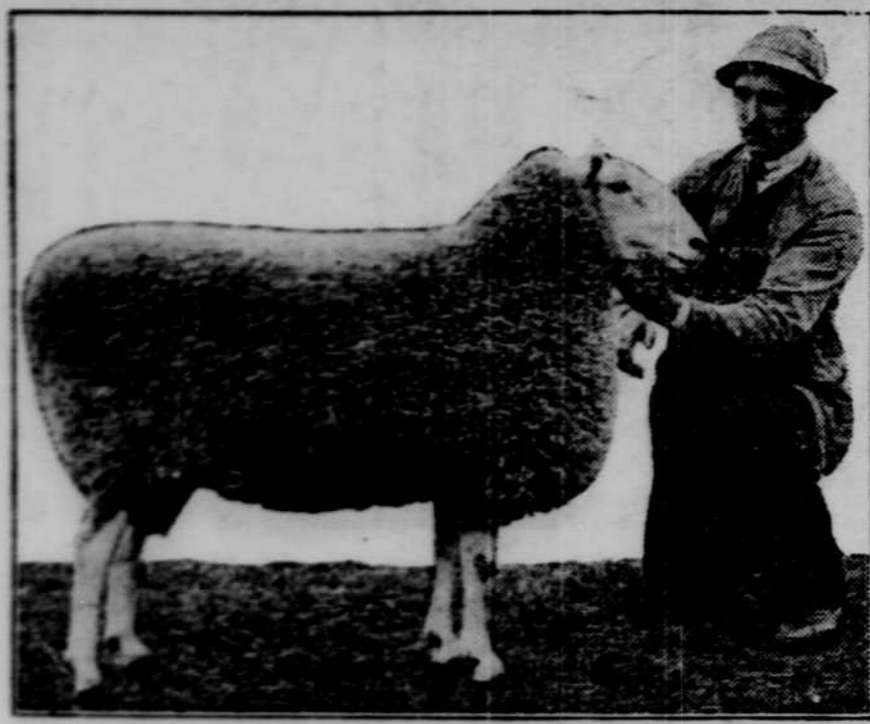
Good for Wool and Mutton.

Much has been written and said of the enormous profits to be made from the keeping of a few sheep on the corn-belt farm. Some have figured that it costs from $2 to $3 per year to keep a sheep and that the fleece would just about pay that. Others, pessimists, say that the losses from keeping sheep are so heavy that there is absolutely no profit, due to the ravages of disease, vermin and internal parasites. Between these two will be found the middle way that seems to catch the bulk of the sheep raisers.