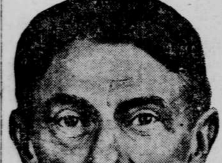
John Montgomery Ward.

Federal baseball league officials, not to be outdone by organized baseball, which has its world's series spoils to dangle before the eyes of players, will go their rivals one better in the way of a prize by giving a $4,000 automobile to every member of the team which wins this year's Federal pennant.