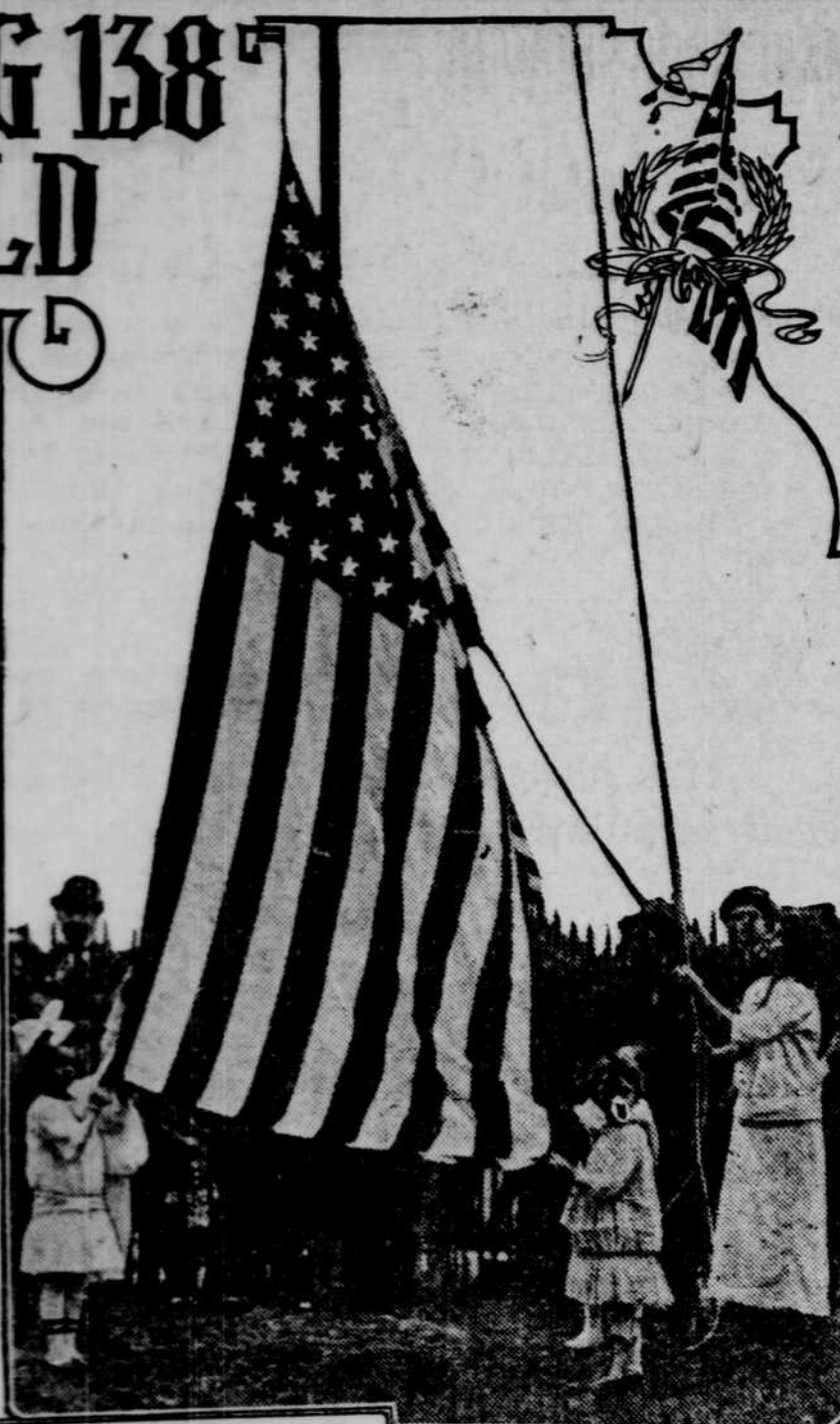
RAISING OLD GLORY ON FLAG DAY.

The recognition of this anniversary and, in large part, the growing reverence for the flag which Flag Day exercises are intended to inspire are of recent birth.