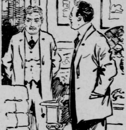
Never Dreamed to See the Haggard-Looking Man Who Stood Before Him.

Brainerd was heart and soul in his work. He was all for reform and good government. The night the convict cartoon came out was one of the happiest of his life.