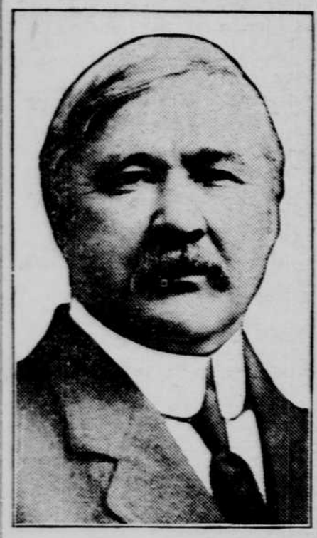
Elwood Haynes, Builder of America's First Car.

The automobile has so established itself in thousands of American homes