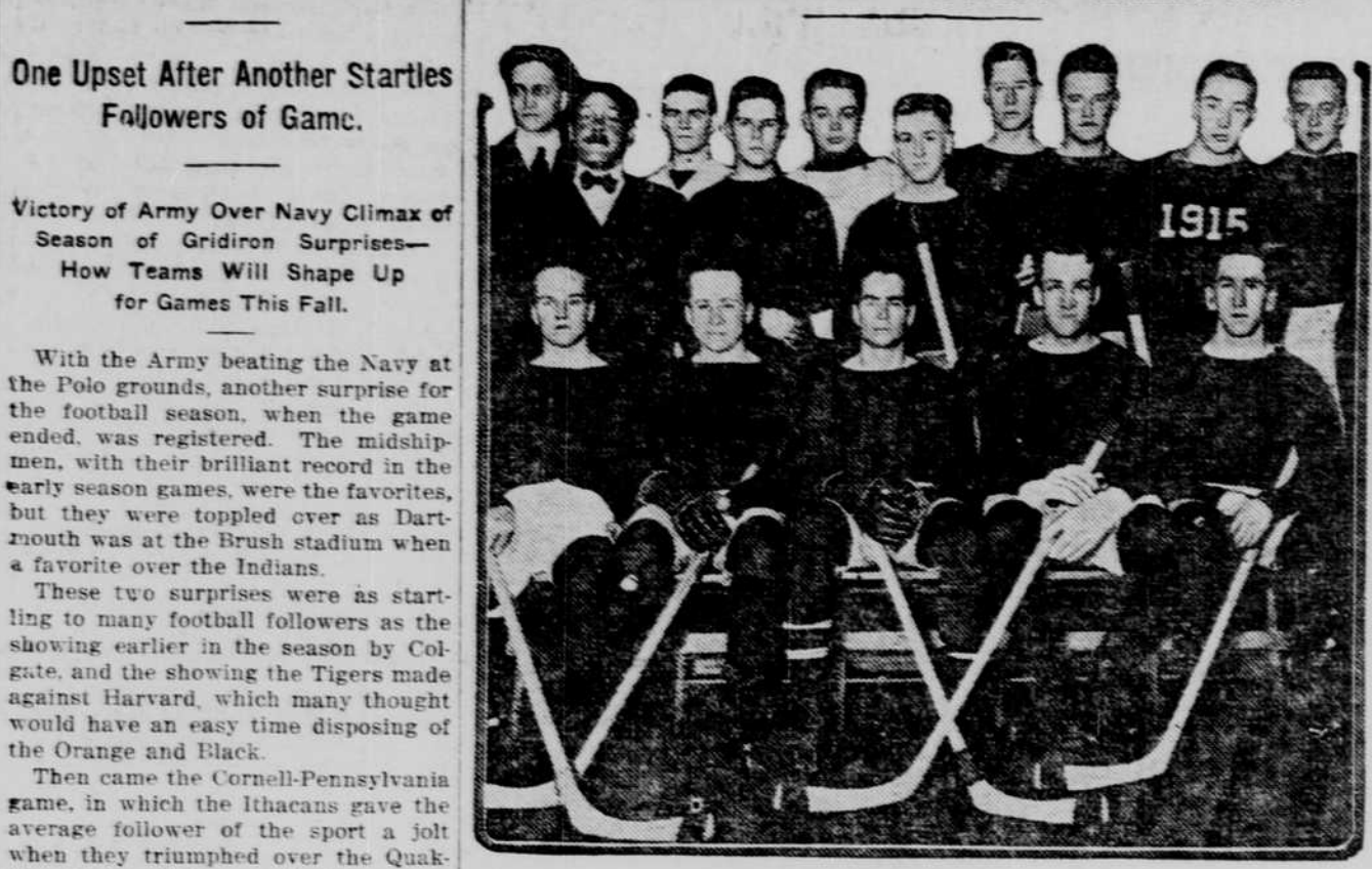
Yale's Star Hockey Players.

From all accounts Yale is going to play an important part again in intercollegiate hockey this coming season. A $100,000 ice rink has been constructed at New Haven. The opening of the hockey season finds the Yale team, the crack players of the winter sport, who by defeating Harvard last year, won the championship honors, in fine shape.