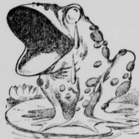
FROM "KICKER" TO "CROAKER."