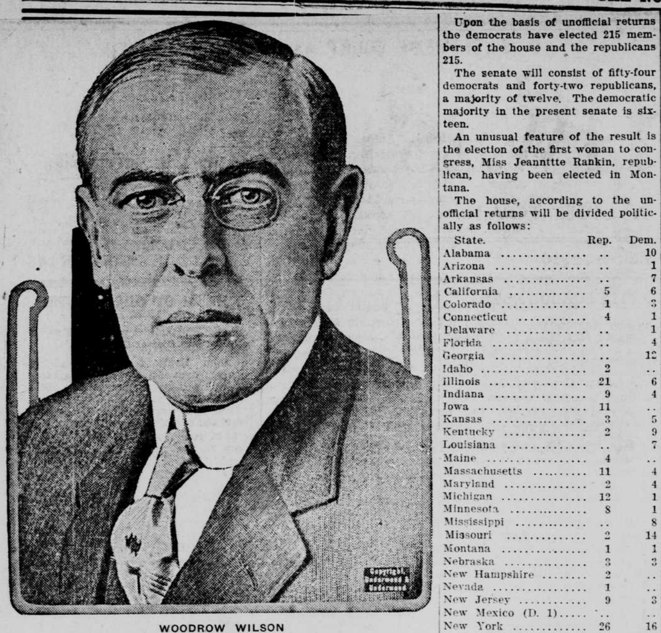
WOODROW WILSON Re-elected President of the United States.