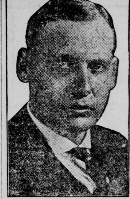
KEITH NEVILLE, of North Platte, Elected Governor of Nebraska.