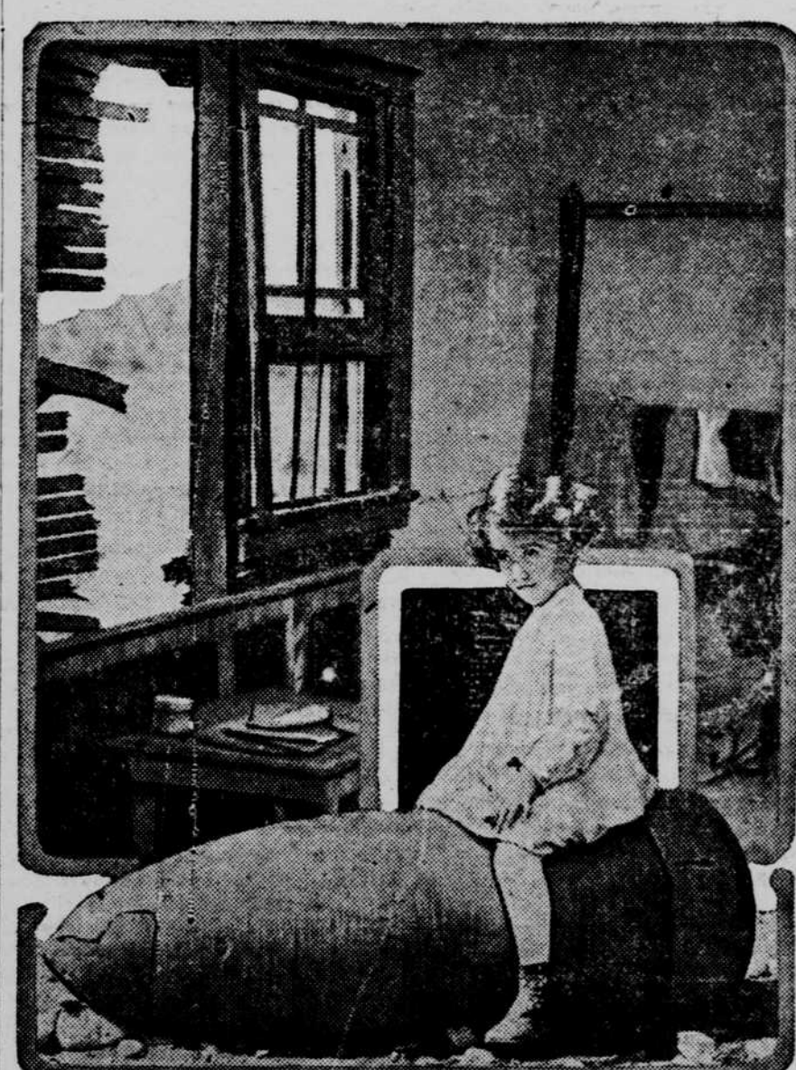
Indian Head, Md., may be abandoned by the United States navy as a proving ground for shells and armament as a result of the ricocheting of a shell in a recent test.