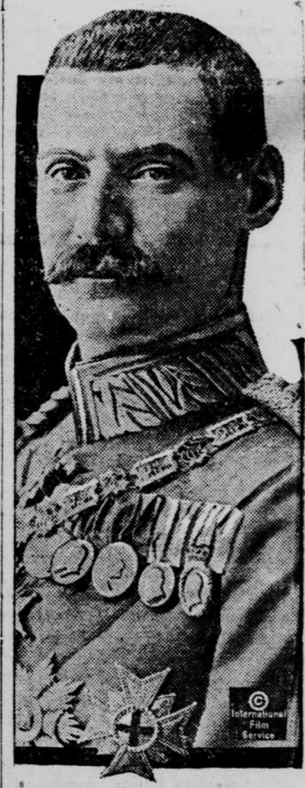
New photograph of Crown Prince Ruprecht of Bavaria, commander of the German forces in the Somme region, where the allies are conducting a great offensive.