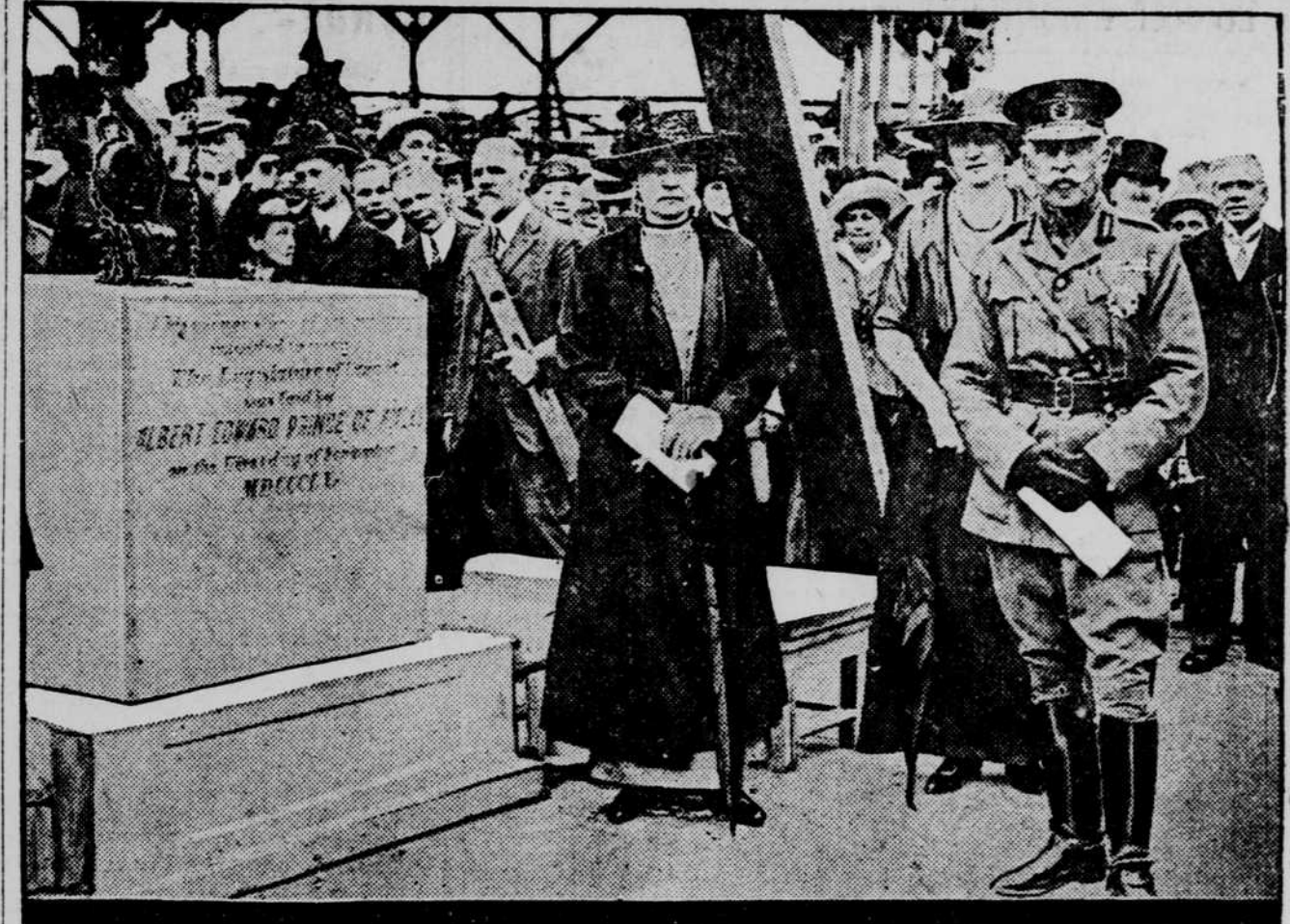
Duke and duchess of Connaught just after the laying of the corner stone for the new Canadian parliament buildings at Ottawa.