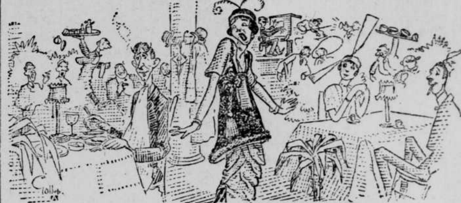
"In th' Cafe th' Low Necked Cabaret Nightingale Sings 'You Made Me Love You' as She Wabbles Aimlessly Among th' Tables Scatterin' Talcum Dust Over th' Steaks an' Caviar Sandwiches."

Oh, fer th' ole restful noiseless days when nothin' disturbed th' peace an' 'quiet o' th' community but th' milkman's bell, or an occasional grind organ! Oh, fer th' joy o' livin' agin through that blissful period precedin' th' advent o' th' raspin' phonograph!