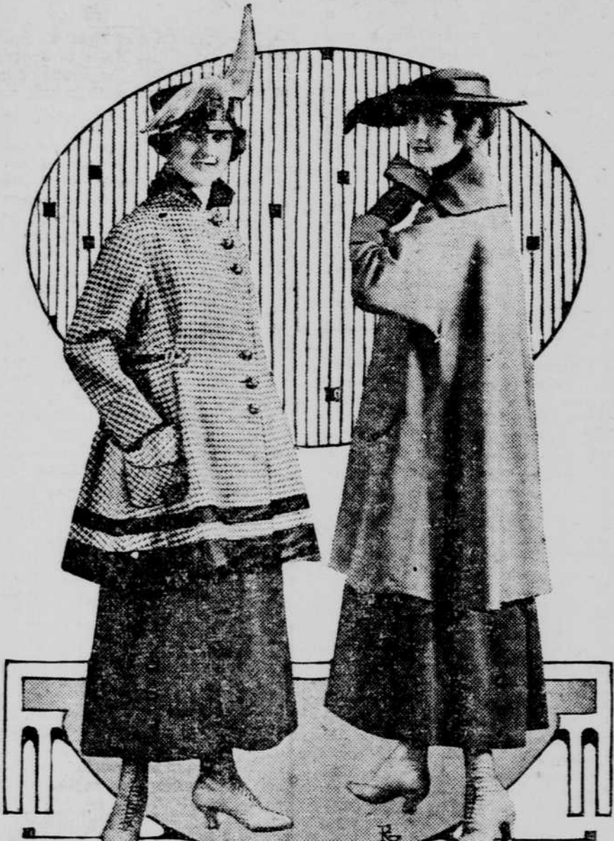
YOUTHFUL LINES IN SUMMER COATS.

The uppers for the slippers are a better selection than this for a coat which must answer for all sorts of wear. It is good for the street or the car. It is severely plain, with no purely ornamental features, and depends for distinction upon original and clever lines and nicety of machine stitching. By these simple means it manages an elegance that is apparent