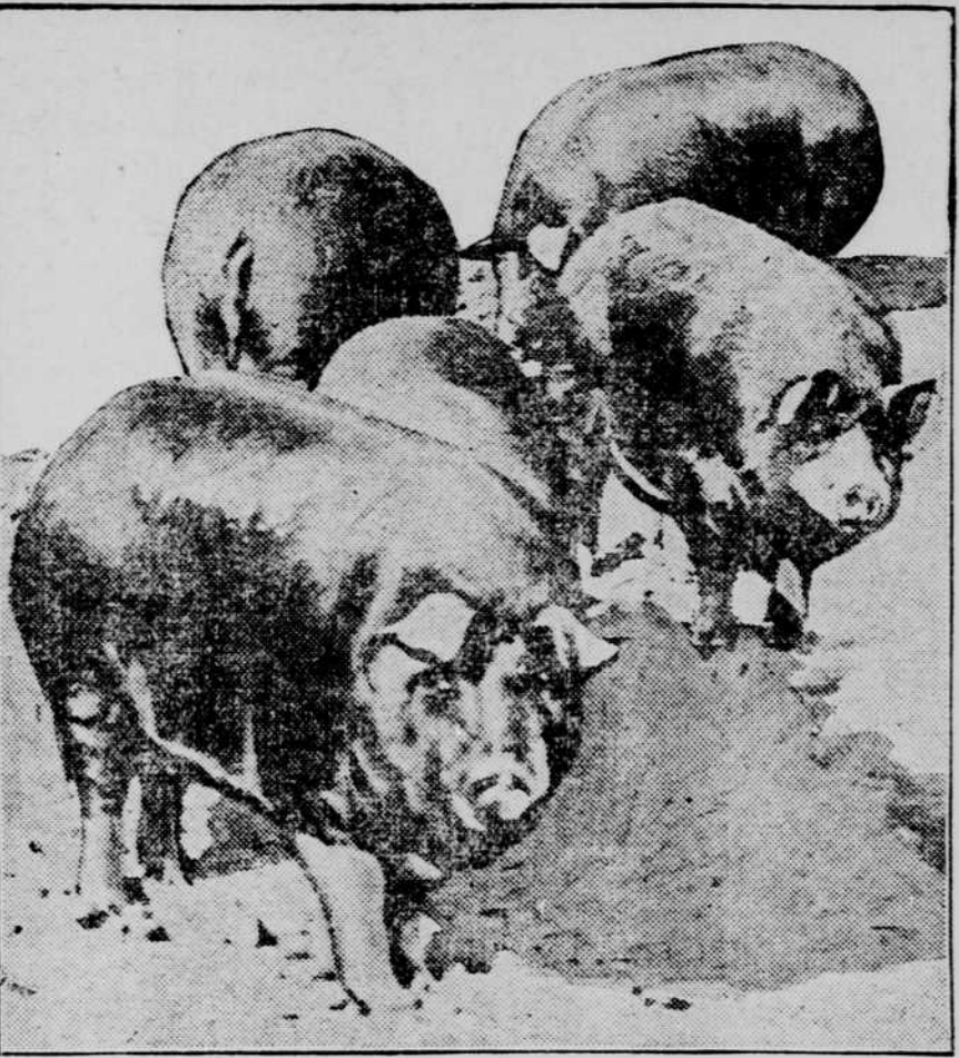
Strong, Healthy and Vigorous Bunch of Hogs.

(By C. W. HICKMAN, Idaho Experiment Station.) The success of the prosperous hog breeder is due to the wise selection of the brood sow. In selection of the individual animal, there are a few points to consider. In general appearance, the sow should be fairly low set, good length, good constitution, deep bodied, strong back and symmetrical throughout. She should stand square on strong feet and legs. Her head should be refined, indicating quality and present a feminine (breedy) appearance. The shoulders should be broad, deep, smooth on top and well fleshed. The back should be strong, slightly arched and with well-sprung ribs. The loin should be wide, thick and strong. The sides should be long, deep and smooth, free from wrinkles. The rump should be broad and well carried out. (not too drooping). The hams should be wide, deep and well filled down to the hocks. The legs should be straight and have quality and substance combined. Other things besides individuality must be considered. One of the most important characters of the brood sow is fecundity, that is, the bearing of large litters. It costs just as much