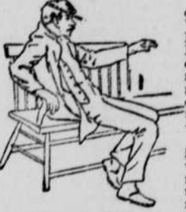
A Wounded Soldier.