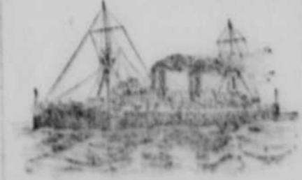
THE O'HIGGINS. (Now belongs to Chile. But May Be Purchased by Uncle Sam.) died for me!" Then the listener clung and observed that whisky was not so good now as it was before the war

spoken of, sir; it is a serious, sad affair. I have two graves in Virginia, one in Tennessee and three in Kentucky, and but for war the men who fill them would be living yet!" "Your sons, colonel?" asked the listener, in an awed voice. The colonel tossed off his toddy neat, and stroking his gray beard said: "No, sir; my substitutes; the brave men who fought, bled and