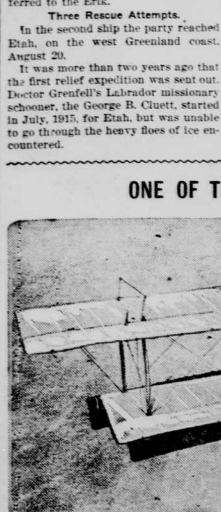
One of the latest types of airplanes being built by the Curtiss Airplane company for the United States. This type will be well represented in the great air fleet now in construction for Uncle Sam.