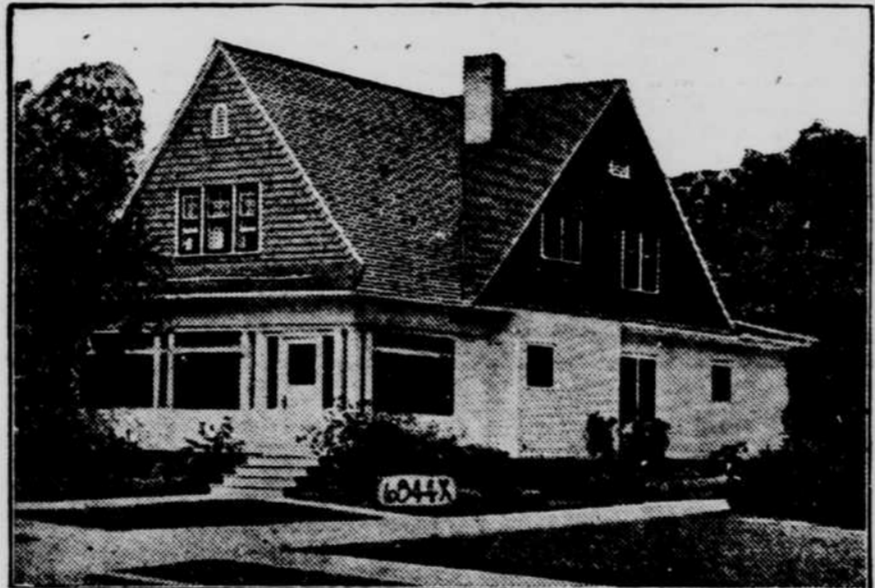
Seven-Room Family House.

The attractiveness of a house which will yield well to a decorative treatment such as that shown in the accompanying view cannot be questioned. The white lower portion, in contrast