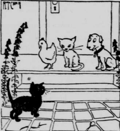
"Is That Dog Polite?"

"Because the family was away on a visit. They will be gone all day, and we are guarding the house. The family are so nice and kind to us that we wanted to see that no unwelcome callers got in. When they get home