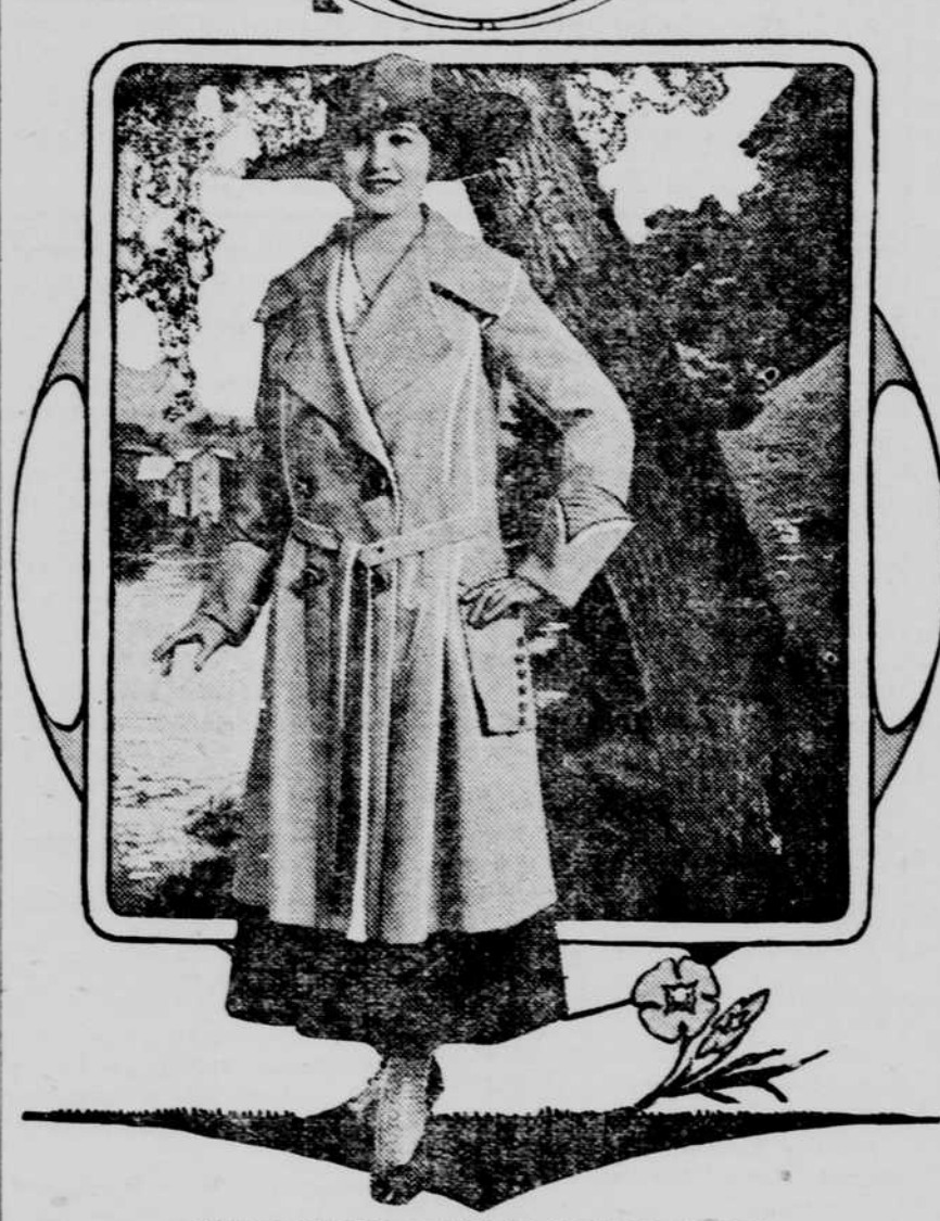
UNSURPASSED STYLE IN COVERT COATS.

But once more they heard the doctor talking, and this is what he said: "In two days you can go out to play if you will stay in the Sun."