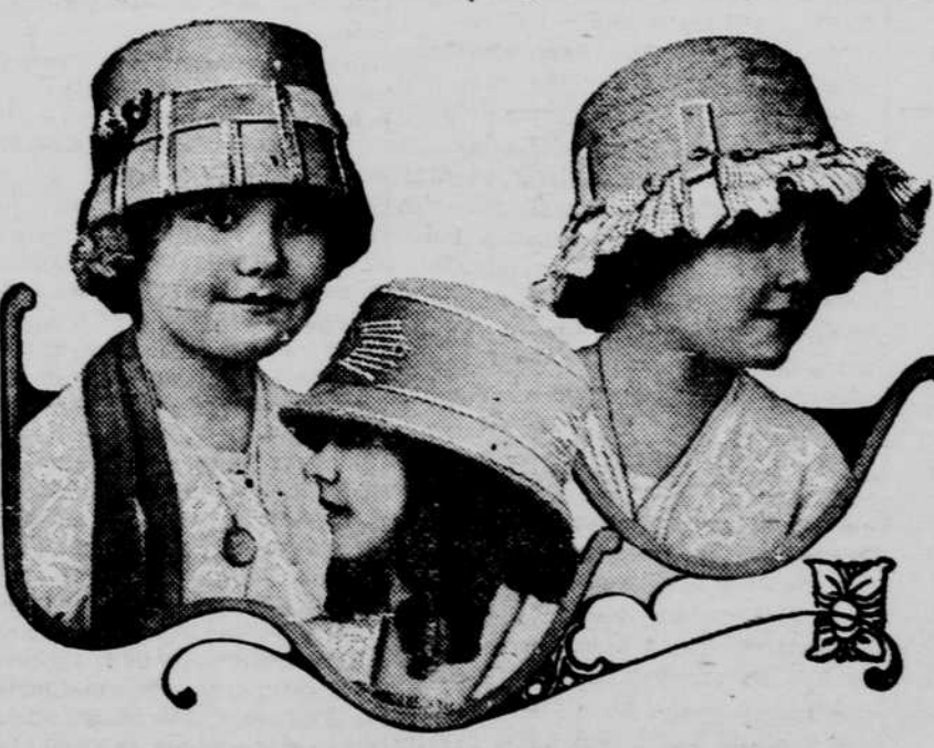
BRAID AND SATIN HATS FOR CHILDREN.

dresses, which further recognizes in But, for very little girls and for oldwide revers at the front and a cape er ones, these satin-covered shapes, collar. The very ample, flaring cuffs which they are privileged to wear with are beautifully tailored, with a ma- needlework decorations, like their elchine-stitched V-shaped panel set in ders or with trimmings distinctly childthem and the same encoellishment ap- ish. In the latter class belongs the litpears on the pockets. These are of the the hat with a band of velvet ribbon patch variety, cut long and narrowed about it and alternating short and long toward the bottom with a flap at the strips of narrow fancy braid about the