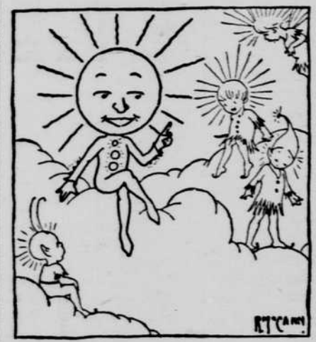
"Listen Now," Said the Sun.

"The doctor comes every day," continued the Sun. "Sometimes he comes twice a day, and once he came three times. But every time he comes he tells the little boy always to sit in the sun! And he has been following me around. When I am shining into