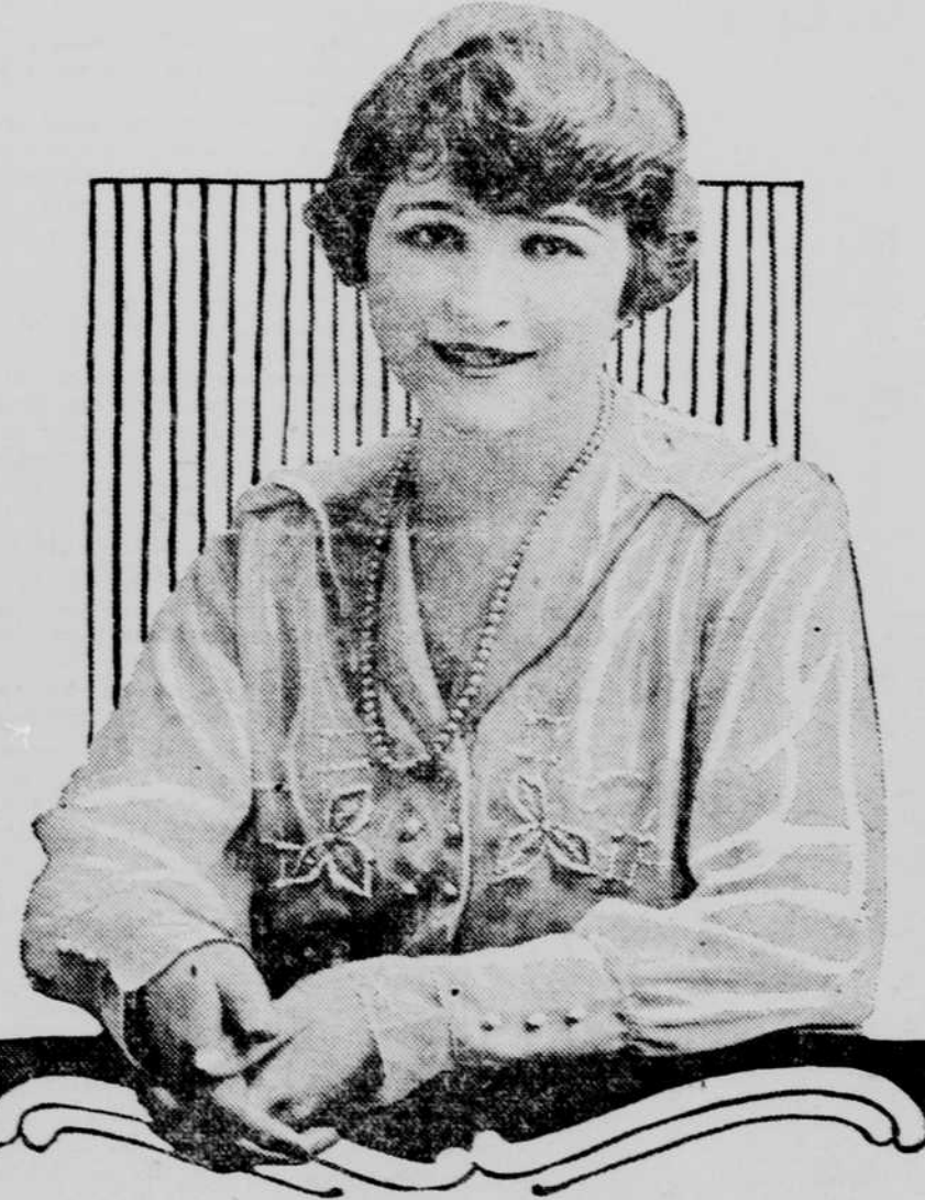
GEORGETTE UNRIVALED IN SPRING BLOUSES.

embroidered and beaded with silk in Joffre blue. The same model, shown in sand color, is brightened with embroidery in coral pink. The tiny buttons used are usually satin covered and of the same color as the embroidery. Sleeves continue long; collars open at the throat and have more or less of a cape at the back. Some of them are convertible and there are models specially designed for thin women with satin vest fronts extended into a narrow panel at the front of a standing collar. Seams are hemstitched.