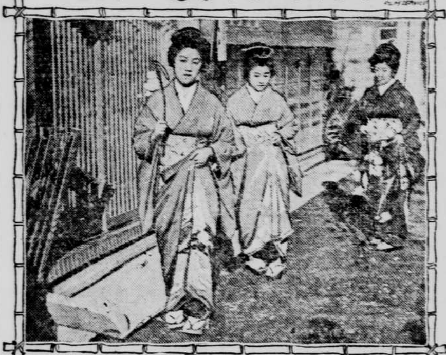
New Year's day has come to rank as one of the most popular of the Flowery Kingdom's holidays. As in America it is a day of feasting and good cheer, though oddly tempered by religious observances. The above picture shows three Japanese belles on their way to the temple for prayers before starting on a round of New Year's balls.