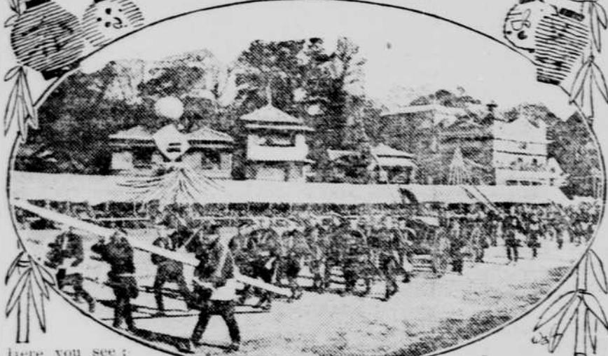
Have you seen a parade of Tokyo firemen on New Year's day on their way to the drill grounds for the annual inspection, one of the big features in the way of celebrating the first day of the year in every Japanese city of any size. Fire engine and equipment pass in review before the city officials, after which drills are performed and the firemen take part in contests of various kinds. The fire engine has only recently been introduced into the Island Kingdom and the modern auto-truck is not yet known there. In the lower picture are shown the firemen with their bamboo scaling ladders which are used not only for life-saving and as an elevation from which to direct the water from the hose nozzle, but as a ramp with which to knock down buildings too far gone to save and so prevent the spread of the conflagration. The Japanese firemen are wonderful acrobats and perform truly remarkable feats on the tall ladders, scaling them with the agility of monkeys. Men, women and children turn out to watch the exhibitions. Note the odd costumes of this brigade from Tokyo.