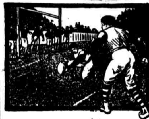
EVERY SUCCESS HAS ITS OWN GOAL.

Get the best—Henderson & Ames' uniforms, at Armstrongs.