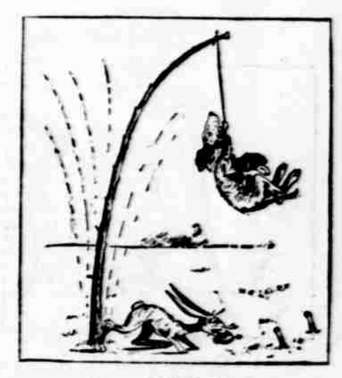
4-and I'll finish it.

She—You serpent. He [gallantly]—You shake charmer.