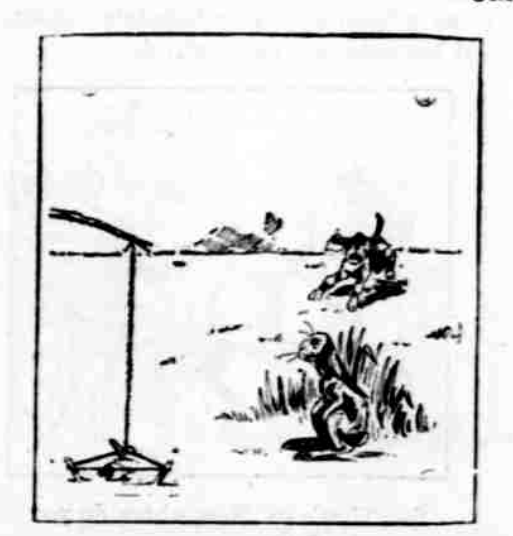
2-but there comes a dog-