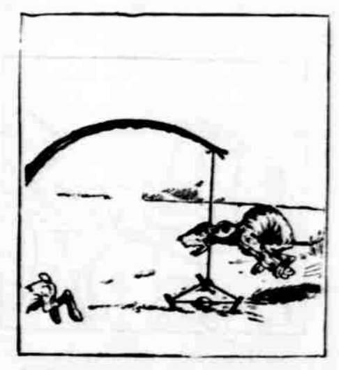
3-I guess I'll let him take the first bite-