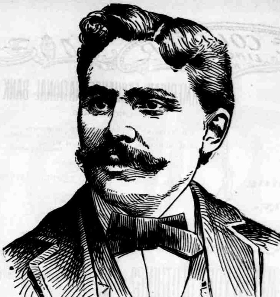
SAVANNAH, N. Y., Me ch 18th, 1894.