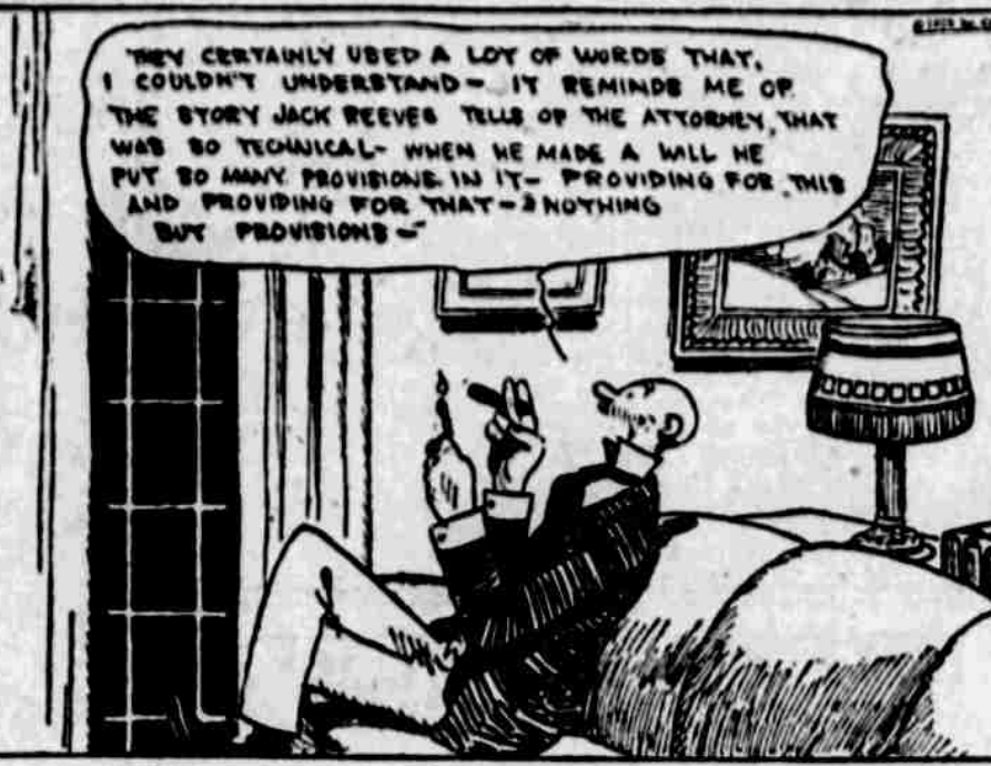
SEE JIGGS AND MAGGIE IN FULL PAGE OF COLORS IN THE SUNDAY BEE