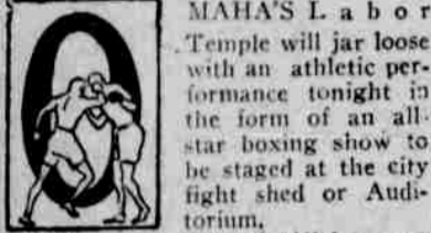
MAHA'S Labor Temple Earl Puryear will jar loose with an athletic performance tonight in the form of an all-star boxing show to be staged at the city fight shed or Auditorium.

Thirty rounds of the biff 'em and take sport together with ring science and rosin go to make up what promises to be one of the best fistic dishes ever handed over to the dear of public.