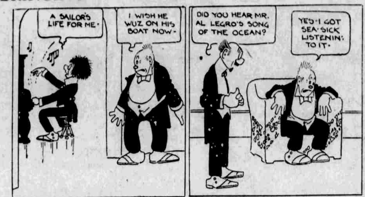
1128 © 1921 by INT'L FEATURE SERVICE, INC.