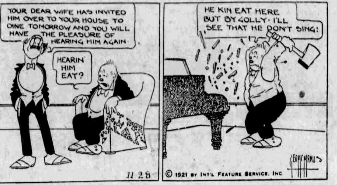
1128 © 1921 by INT'L FEATURE SERVICE, INC.