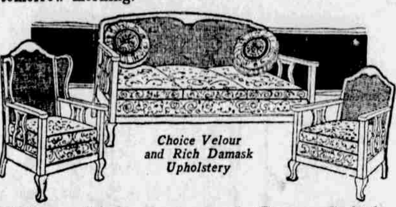
3-Piece Mahogany and Cane Suits!

These suites are certainly superior in their construction and every detail is a detail of excellence in material and workmanship. We know you will recognize this sale to be something wonderful. It starts tomorrow morning.