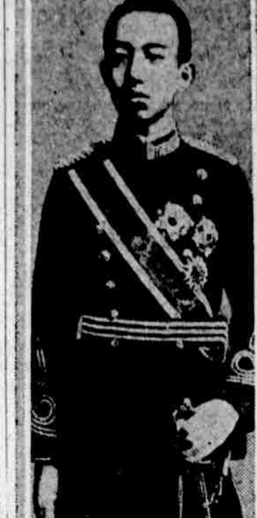
CROWN PRINCE OF JAPAN